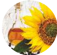
High Oleic Sunflower