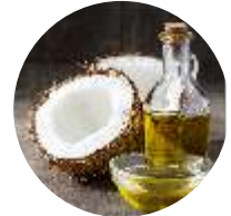
Medium Chain Triglyceride (MCT)