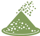
Encapsulated salts for improved structure